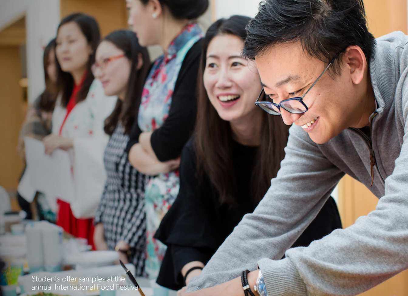
Students offer samples at the annual International Food Festival